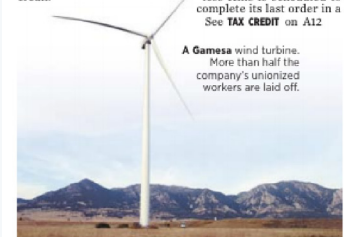
A Gamesa wind turbine. More than half the company’s unionized workers are laid off.

Gamesa’s plant in Fairless Hills is scheduled to complete its last order in a See TAX CREDIT on A12