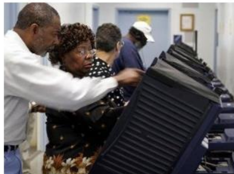
View full size

Louisiana lawmakers slacked off the pace of filing and passing changes to the state Constitution at their recently concluded annual session, approving just five of the 31 they introduced.